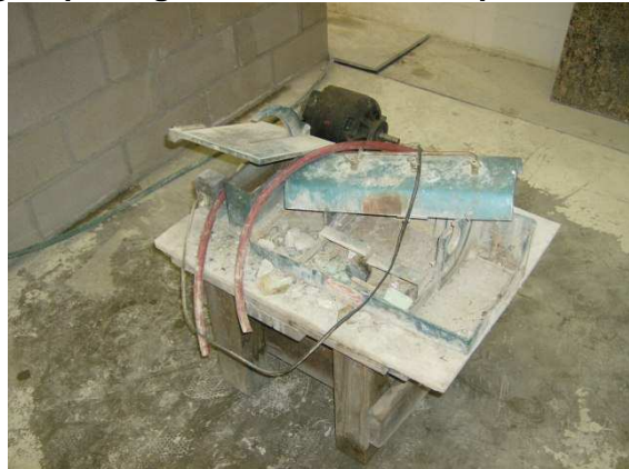
Unloading the cab machine (left) and (right) the machine will need some work!