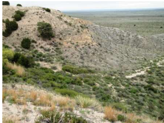
Collecting area (gray area in distance)

☀☀ Here's a rundown from Dan Alfrey of field trips that are in the works: