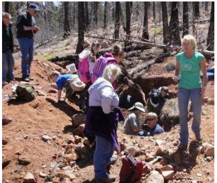
The Mothers Day pocket is very popular today!