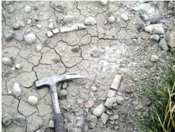
Baculites in weathered Pierre Shale