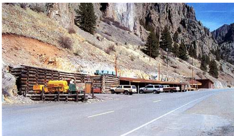
Creede Underground Mining Museum; meet across the road, on the right

Contact Dick Lackmond Lackmond@msn.com or Dan alfreydan@aol.com to reserve your spot!