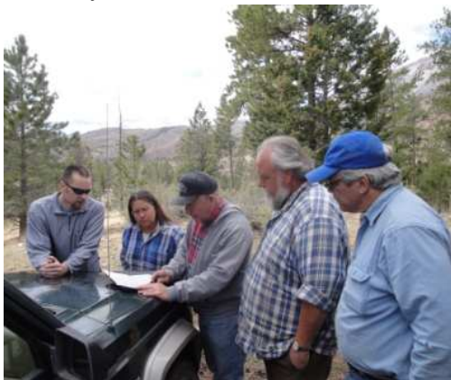
Reconnaissance group

☀☀ On May 15, several members checked out potential Club claims at Wigwam Creek.